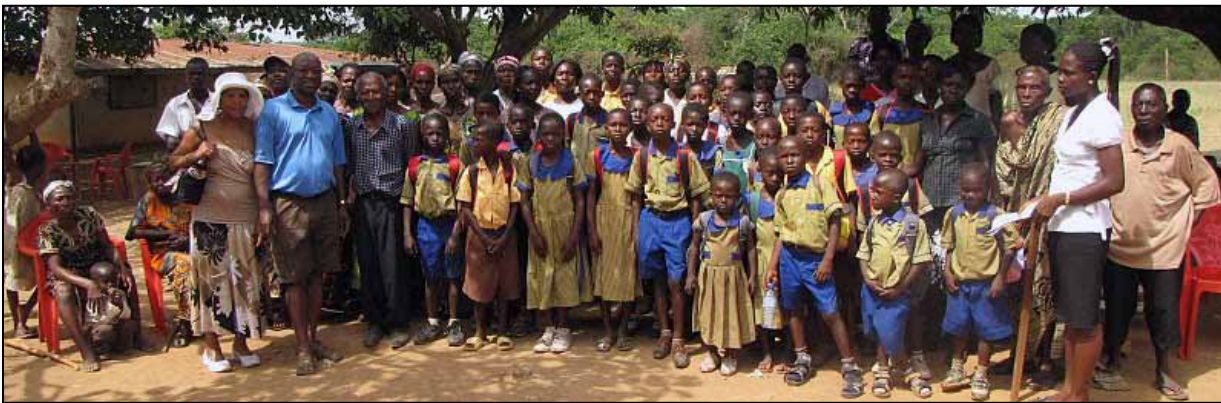
Sponsored children and parents in Agbozume village.

W e left Vancouver on February 23, 2010, in the middle of the winter Olympics. Arriving in Accra, Ghana on the 24 th , we met with the Ghana Advisory Board members to plan the road trip and all the things that were needed.